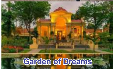
Garden of Dreams