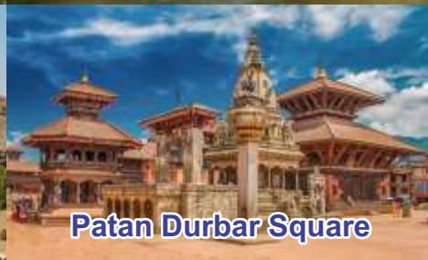
Patan Durbar Square