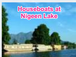
Houseboats at Nigeen Lake