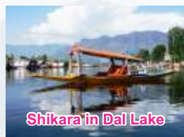
Shikara in Dal Lake