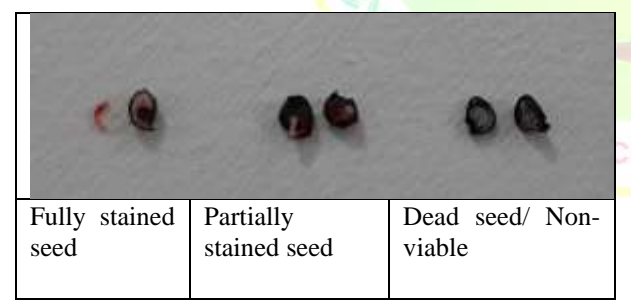
Fig. 1. Different stained condition of onion seed after viability test

*Figures are the means of four replicates of 100 seeds for germination test, and two replicates of 50 seeds each for tetrazolium test.